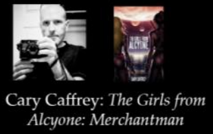
Cary Caffrey: The Girls from Alcyone: Merchantman

Happy reading and writing, Your 2013 Fog Lit Festival Board