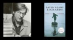
David Adams Richards: Mercy Among the Children